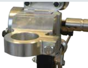
[ 2 ] Clamping collar holder