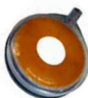
[ 11 ] Sealing disc