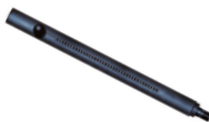
[ 7 ] Core bit removing device