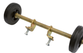
[ 4 ] Wheel set