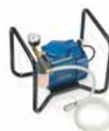
[ 8 ] Vacuum pump