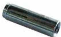
[ 5 ] Anchoring dowels