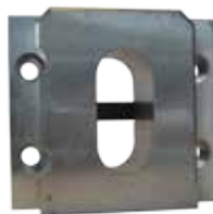
[ 3 ] UNIVERSAL quick-clamping motor plate