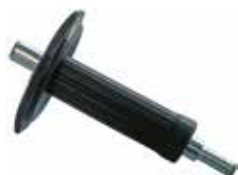
[ 6 ] Anchoring iron